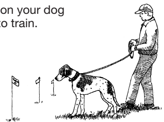
Give one tug and warning at the flags, "No."

Your Dealer set the receiver to a training level appropriate for your dog and helped you introduce your dog to the correction. Phase Two helps you reinforce your dog's new boundary and the consequences if he crosses the training flags.