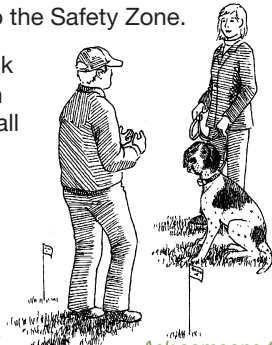
Ask someone to be a distraction.