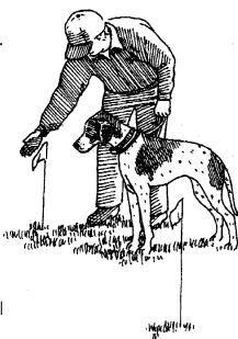
Give a verbal warning at the flags, "No."